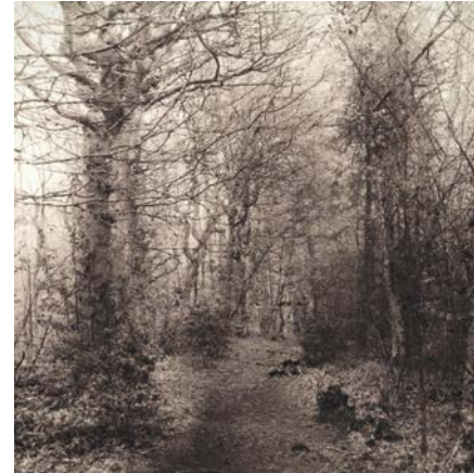
Into The Woods - A triple exposure taken stepping along the woodland path at Pressmennan printed onto canvas.

In 1623 the Privy Council halted the felling of the woods, arguing that they were home to deer for the king's sport. The mixed woodland in the reserve is said to contain some of the last remnants of the ancient woodland which clothed much of Scotland before it was cleared.