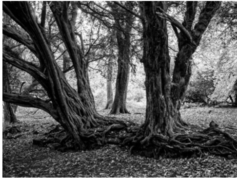
A Study of Trees and Roots - A deciduous mix of sessile oak, ash and wych elm found while stravaiging about the ancient woodland of Roslin Glen Country Park. This picture plays with the themes of SPACE and RATIO in various ways.

McEwan Hall, Edinburgh - the magnificent home of the University of Edinburgh graduation ceremonies, and Bristo Square, a beautiful public space and central hub for students during term time and for tourists during the festival season, are eerily quiet as the government introduced tougher measures in a bid to contain the spread of COVID-19.