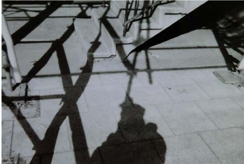
Ley (meadow) lines are energetic pathways that criss-cross the country, converging at sacred sites.